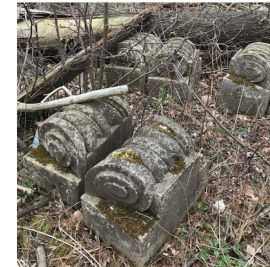
Stone 04 Scroll Capstones