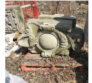
Stone 05 Shield with Ball