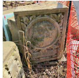
Stone 02 Figurative Wall Panel