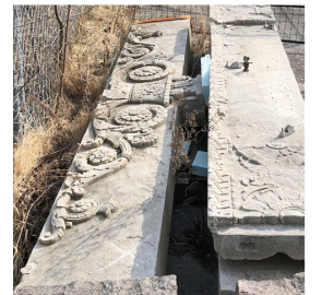
Stone 11 Decorated Lintel Stone