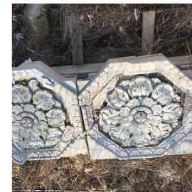
Stone 10 Rosette Wall Stone