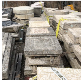
Stone 01 Decorative Column Panel

26 Wayland Avenue, Toronto, ON M4E 3C7 Cell 416 579-9947