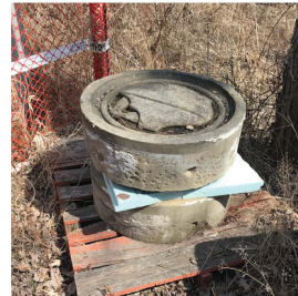
Stone 03 Roundel with Shield