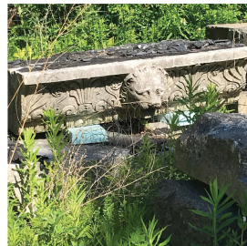
Stone 07 Lion Pavilion Stone