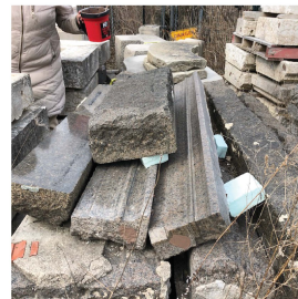
Stone 08 Cornice Capstone