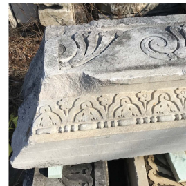
Stone 09 Decorative Wall Stone