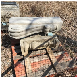
Stone 06 Scroll Bracket