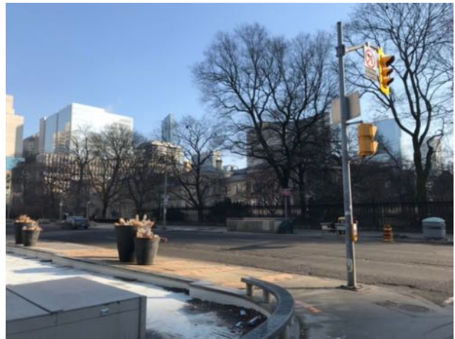
View of the full border of trees along University Half of the tree border would be lost.