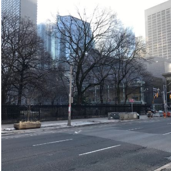
This tree border along University Avenue would be lost.